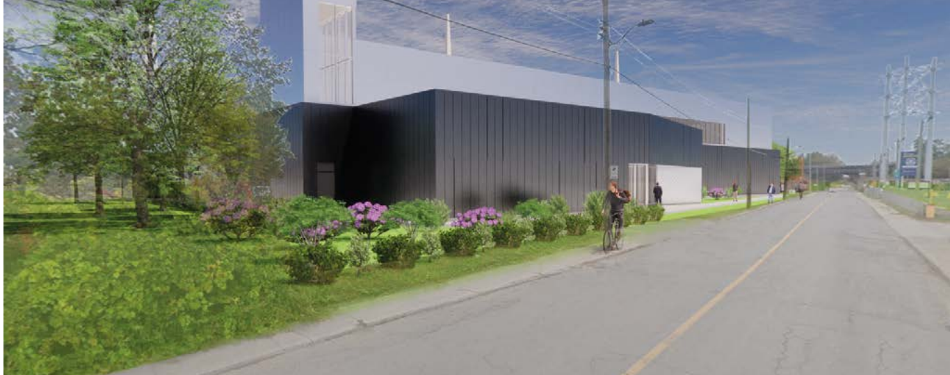
Simulation of future Rockfield substation