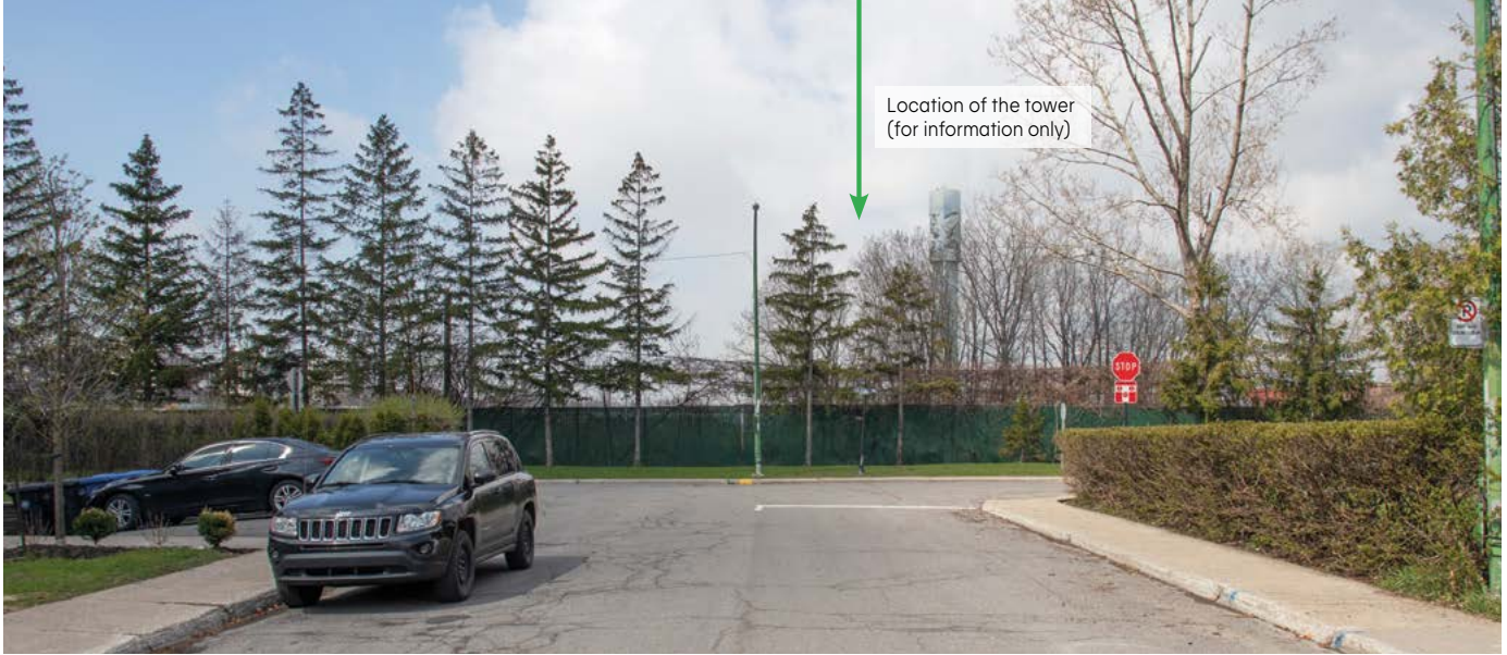
Croissant Aldred – Place Aldred