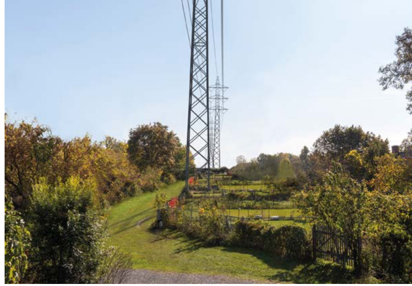
Visual simulation of the current line (on the left) and the planned line (on the right), Montréal-Ouest